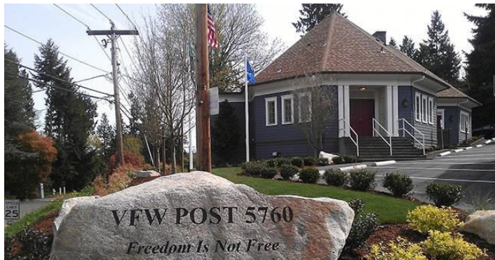
Mercer Island VFW Post 1836 72nd Ave SE, Mercer Island

Although this is a free event, pre-registration will be required. Visit http://pugetsound.usnachapters.net to register.